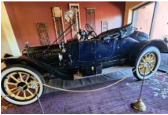
This Packard greeted us as we entered the banquet hall. I think it is a 1914 Runabout.