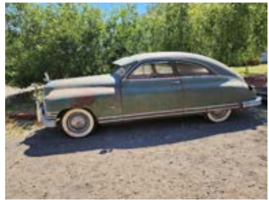
A very nice Packard ready for show time and driver for sale.