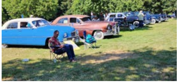
Buttercup between her all-original younger country cousin and a Woodie.