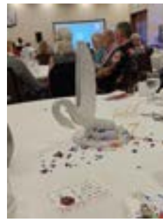
A Member of the NORCAL Region made these center pieces and they were awarded to person at the table with birthday closest to the date of the banquet.