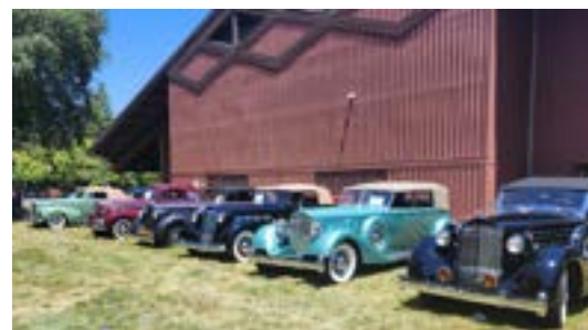
Another row of Packards.