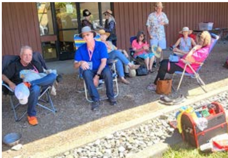
The San Diego gang taking a break. We should know them all by now.