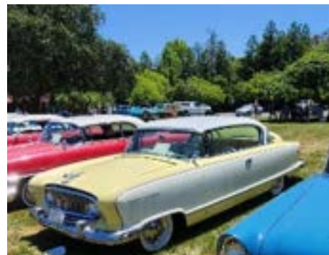
A Packard powered boat and a Nash powered by a Packard V-8 and Ultramafic transmission.