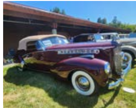
On the left is a Darrin. On the right not a Darrin. Read more about this one-off iconic Packard in future issues of the Predictor .