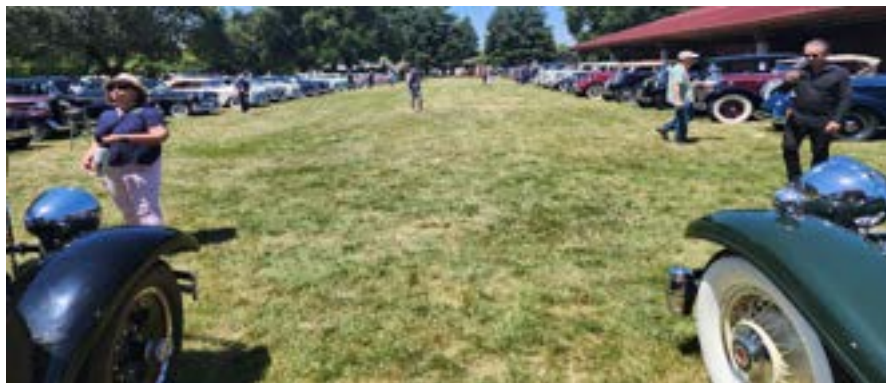
One row of Packards.

I doubt I will ever see this many Packards in one spot again. I believe there were 120 Packards ranging from a 1903 Model F to a 1956 Caribbean. Numerous one-off Packards with interesting histories. If a vehicle had a Packard engine it was allowed in. The only thing missing was a P-51 fighter Plane. A very nice 1954, I believe, was sideswiped by an 18-wheeler and wiped out the right side. Fixable but certainly costly.