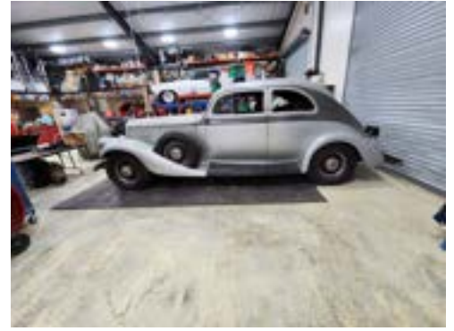
A Packard in the shop, a Pierce Arrow 12 awaiting a tune up, and a Pierce-Arrow. A Silver Arrow Model?