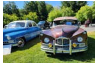
Another Darrin. On the right not a Darrin, but a modified Packard. I saw this Packard at the Concours de Lemon at Pebble Beach last year and was blown away to see it on the show field here. Beauty is in the eye of the beholder, so someone said.